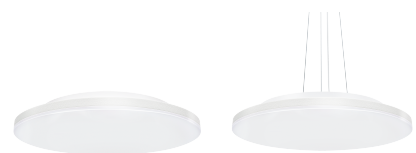
Product Collection Disc 300 Ceiling