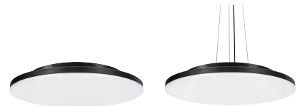
Product Collection Disc 300 Ceiling